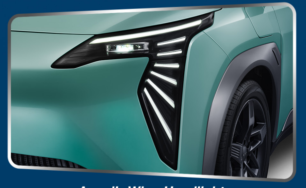
Angel's Wing Headlights