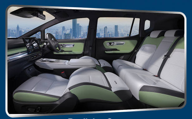
Reclining Seat (1.8 m Super King Size Bed)