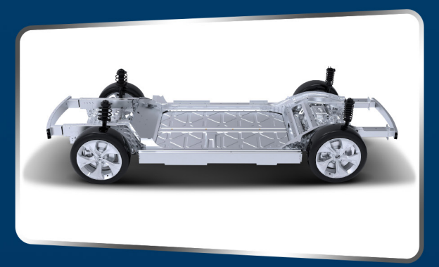
100% Pure EV Platform